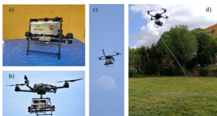
Fig.1 | a) The assembled UAS-THz-CW system in ground station; b) and c) in flight during in-field trials for stability test; d) UAS-THz-CW system in flight during remote sampling with the 5-meter aspiration tube for the collection of the targeted analyte.

Accurate, real-time detection of atmospheric pollutants is essential for advancing environmental monitoring and safeguarding public health. Terahertz (THz) spectroscopy offers strong chemical specificity for gas-phase detection, but its integration into airborne systems has remained limited [1]. To address this challenge, we developed an airborne terahertz continuous-wave (THz-CW) spectrometer integrated with an unmanned aerial system (UAS), reported in Fig. 1.